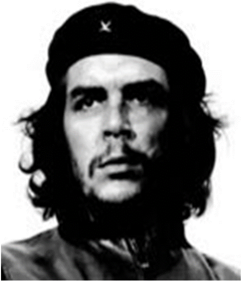
Che Guevara, an Argentinian Socialist Revolutionary

How did the controversial president's trip go down with everyone?