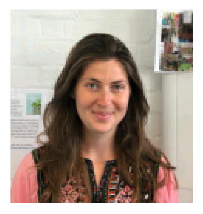
Clara Curie Class