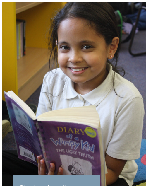
The Joy of reading