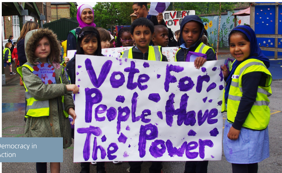
Democracy in Action