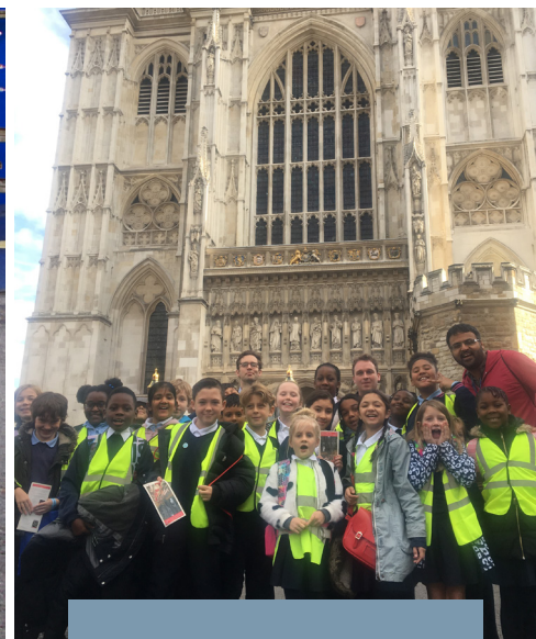
Learning on tour

Millfields Community School is a diverse, inclusive and creative school in the heart of Hackney. Standards are above national trends and the extensive range of curriculum opportunities is relevant to our community, and life in modern Britain. It is based on the core belief expressed in the school's vision and values statement, 'respect for the rights of all'. A respect for the rights of all and a love of and for learning informs the school's curriculum and creates the inclusive and welcoming ethos that is always commented on by visitors to the school.