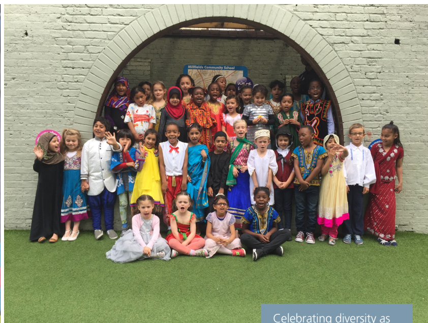
Celebrating diversity as part of British values

Children are always keen to articulate to visitors, the range of ways that they have their voice heard and affect change, as well as how they see themselves as members of the Millfields community.