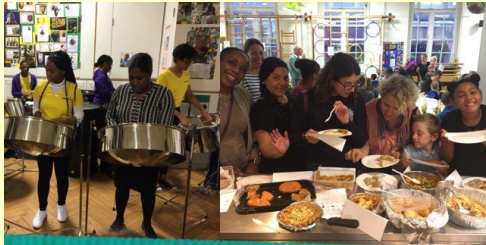
Diversity Evening: Food Families and fun!