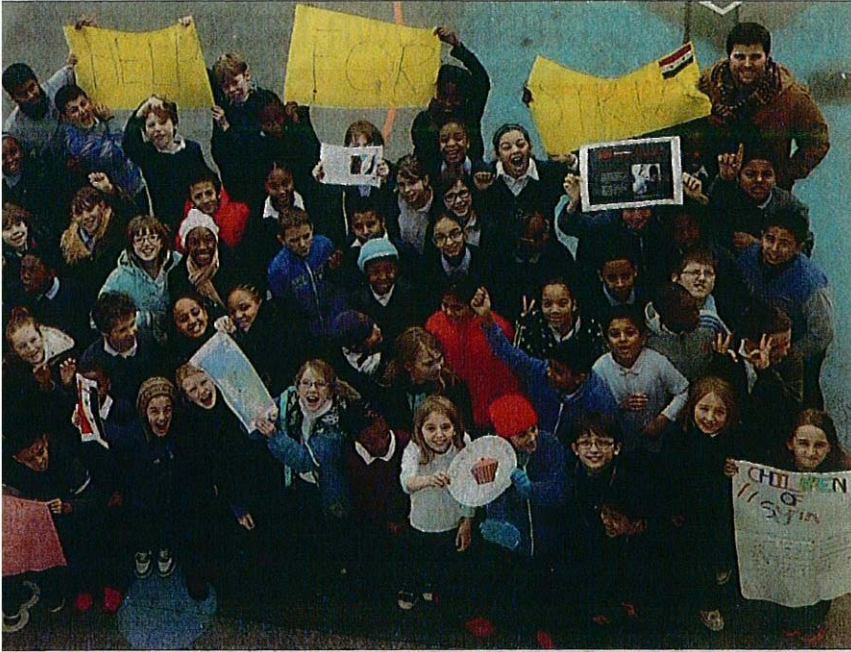
Children rally to support good cause