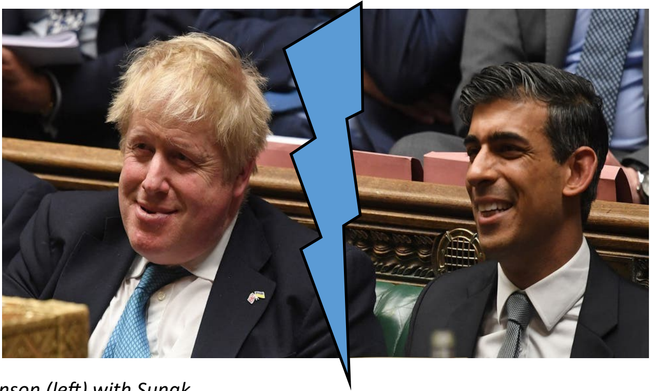
Johnson (left) with Sunak

Sajid Javid, the former Secretary of State for Health and Social Care, recently resigned from parliament yesterday. This was followed, in the same press conference, by Rishi Sunak. Read on to find out more.