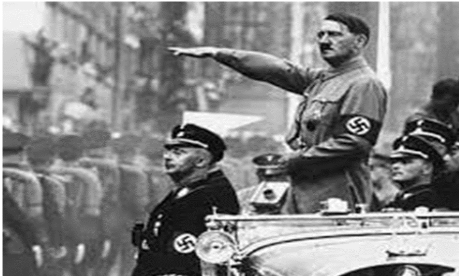
Adolf Hitler - Leader of the Nazi Party

An exploration of Fascism, one of the most dangerous political movements